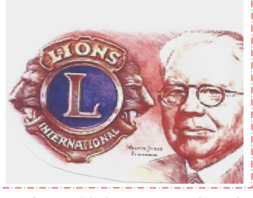
Lions Clubs International