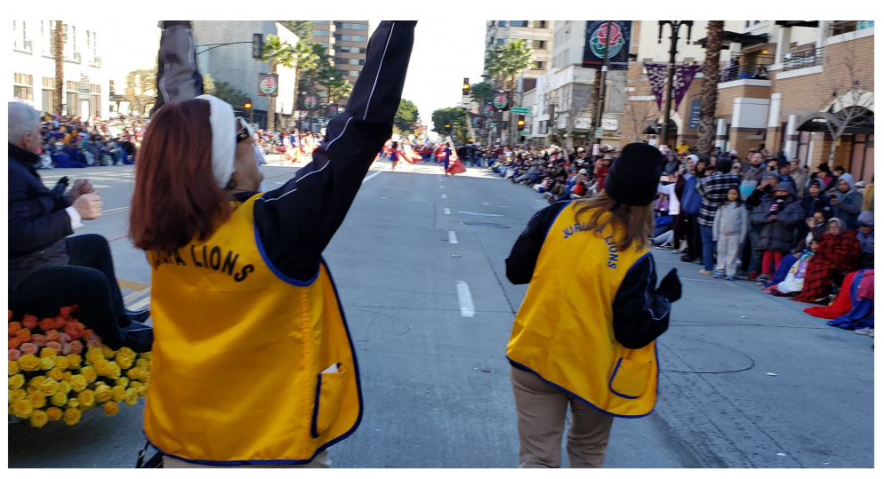
District 4L5 Lions in the Rose Parade

The Lions of Calimesa held a clothing drive in conjunction with their monthly e-waste collection. Clothing collected will be donated to local organizations who serve those in need.