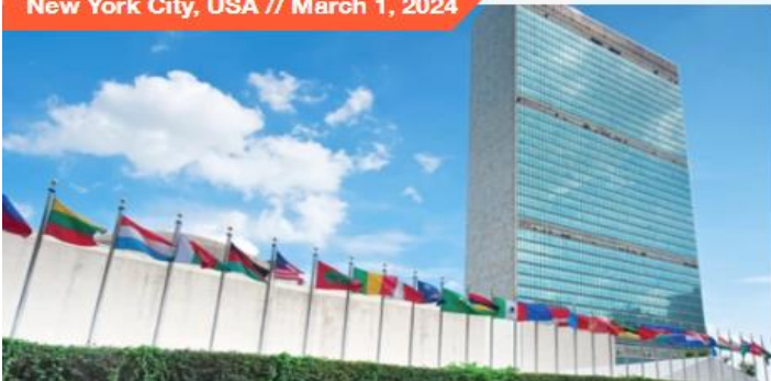
New York City, USA // March 1, 2024