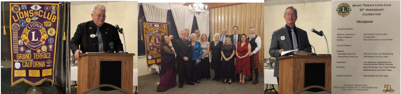
Grand Terrace celebrating its 50th Anniversary in style