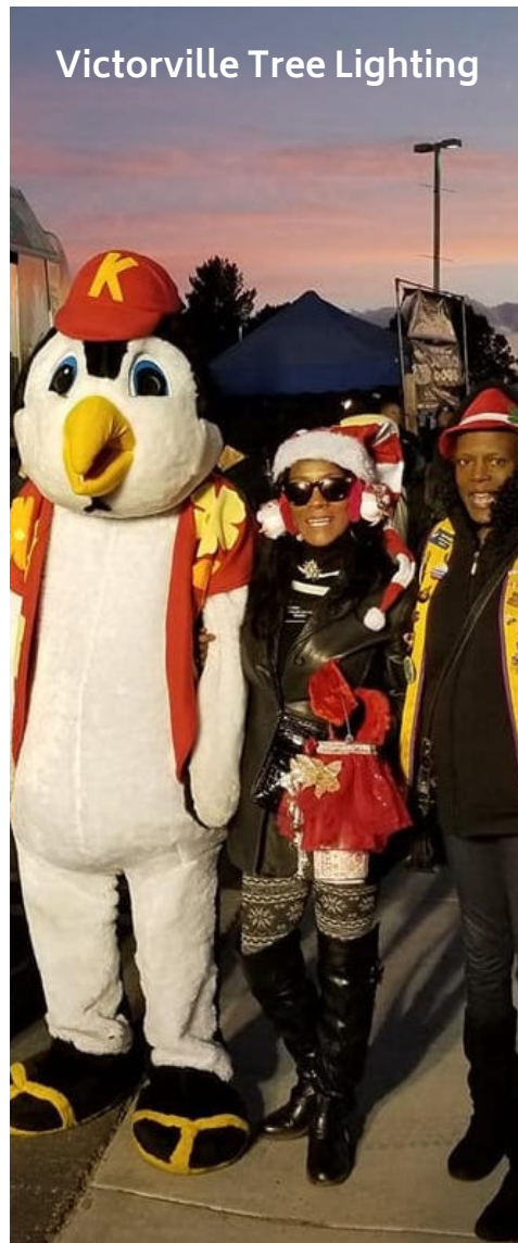
Victorville Tree Lighting