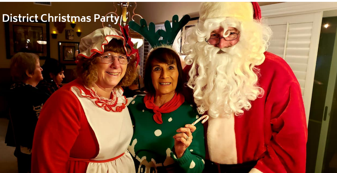
District Christmas Party