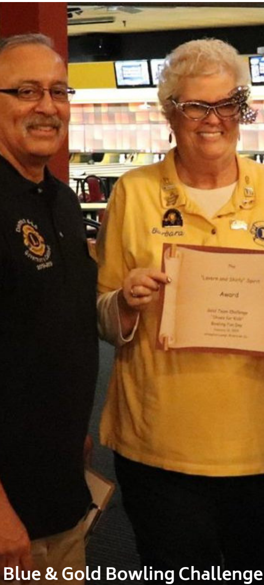
Blue & Gold Bowling Challenge