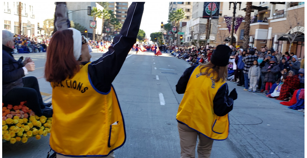
District 4L5 Lions in the Rose Parade